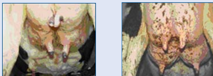
Figure 2. Klebsiella on teats before (blue bars) and after (black bars) predipping

Contact Dairy One Cooperative Inc. at 730 Warren Rd., Ithaca, N.Y. 14850. Tel: 800-344-2697. Email: dmr@dairyone.com Website: www.dairyone.com