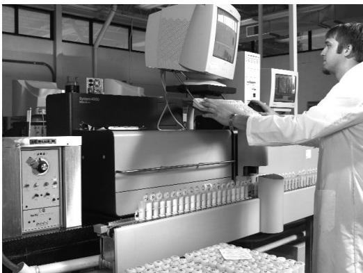
DHI milk samples being tested at the Dairy One Milk Lab, State College, PA

Just like any disease in mammals we can not win if we must intervene on every infection. Rather we must create an environment that allows the animals to spontaneously cure themselves, minimizing the visible signs of infection and maintaining the happy, profitable cows we all enjoy working with. Somatic Cell information gives us the sensitive measure we need for managing their environment.